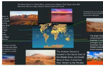
Year 8 Online Geography Learning