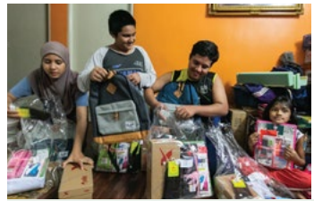
'POWIIS LIKES to give back' stories part II