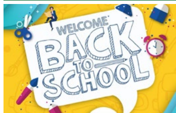
Welcome back to school (Term 2)