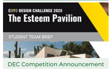
DEC Competition Announcement

The Official announcement is on the Class Of Your Own (COYO) website HERE .