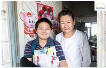
'POWIIS LIKES to give back' stories part I