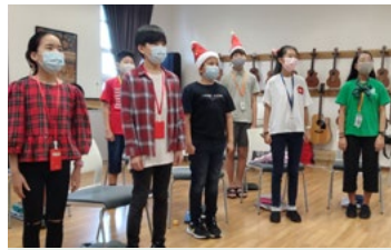
Year 7 - 'There is Power in the Music'