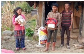
POWIIS Race4Good overcoming mid-race challenges of Round 2