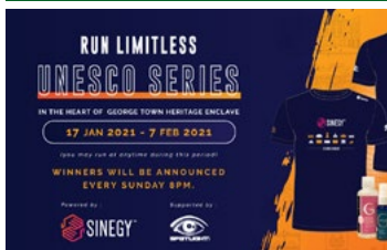
Run Limitless Fun Run (17 Jan - 7 Feb 2021)