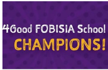
Winners of Fobisia Race4Good challenge!