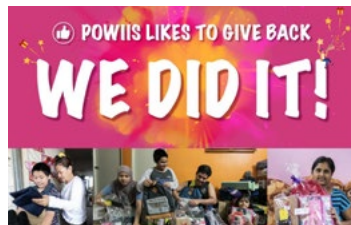
'POWIIS LIKES to give back' campaign final