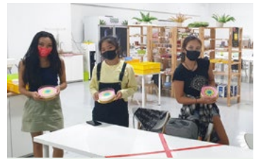
Boarders activities during the festive season