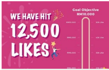
'POWIIS LIKES to give back' campaign

Click on the thumbnails below to read more of the article.