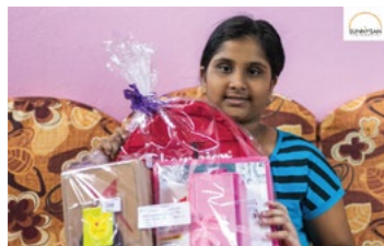
'POWIIS LIKES to give back' stories part III