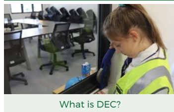
What is DEC?