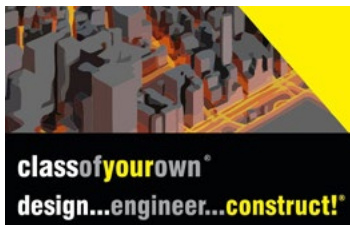
Design Engineer Construct (DEC) learning programme