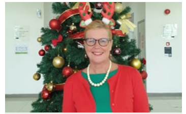
Christmas at POWIIS