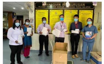
Season of Giving online donation drive by POWIIS Leo Club