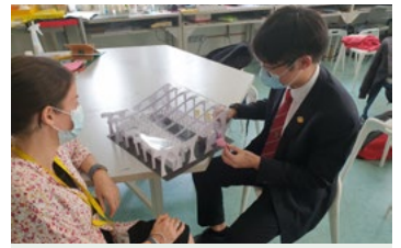
Back to school after CMCO