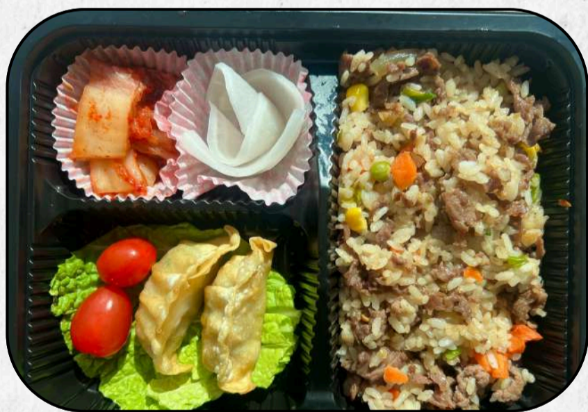
BEEF FRIED RICE 소고기 볶음밥