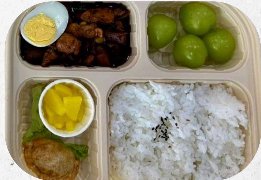
JJAJANG RICE 짜장밥과 만두