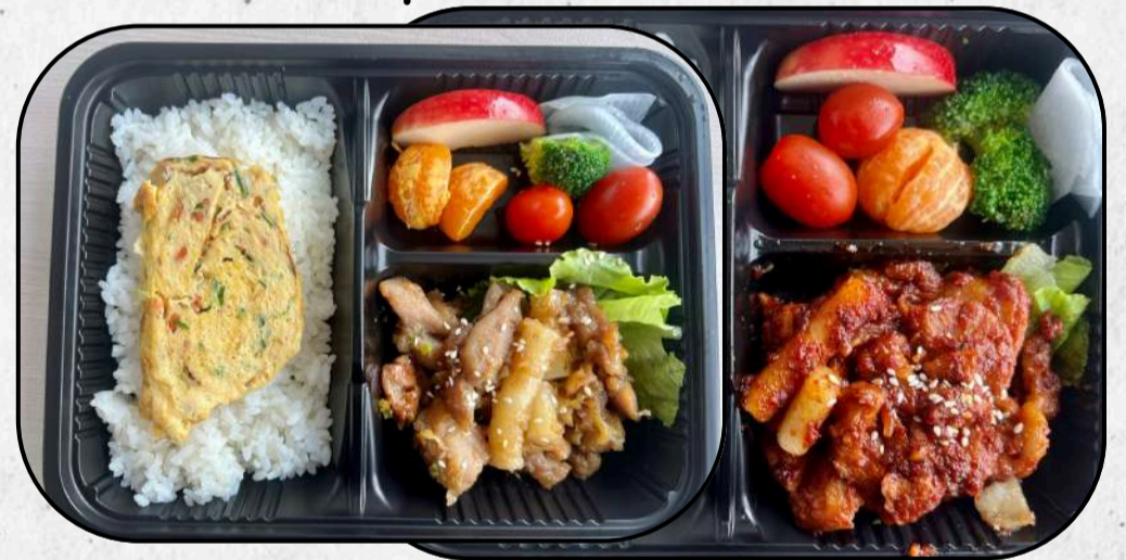
CHICKEN DAKGALBI/ OR BULGOGI