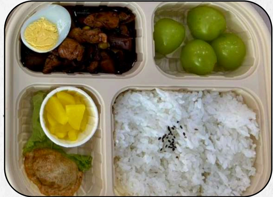
KOREAN JAJANG RICE 짜장밥