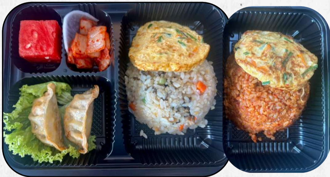
CHICKEN OR DAKGALBI FRIED RICE 치킨볶음밥 OR 닭갈비볶음밥