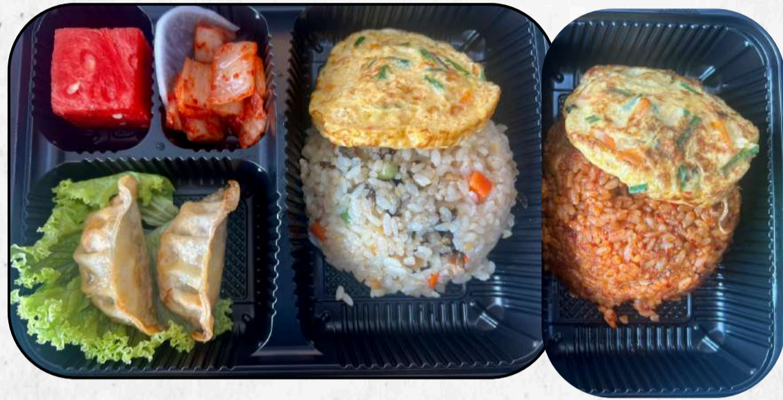
CHICKEN OR DAKGALBI FRIED RICE 치킨볶음밥 OR 닭갈비볶음밥