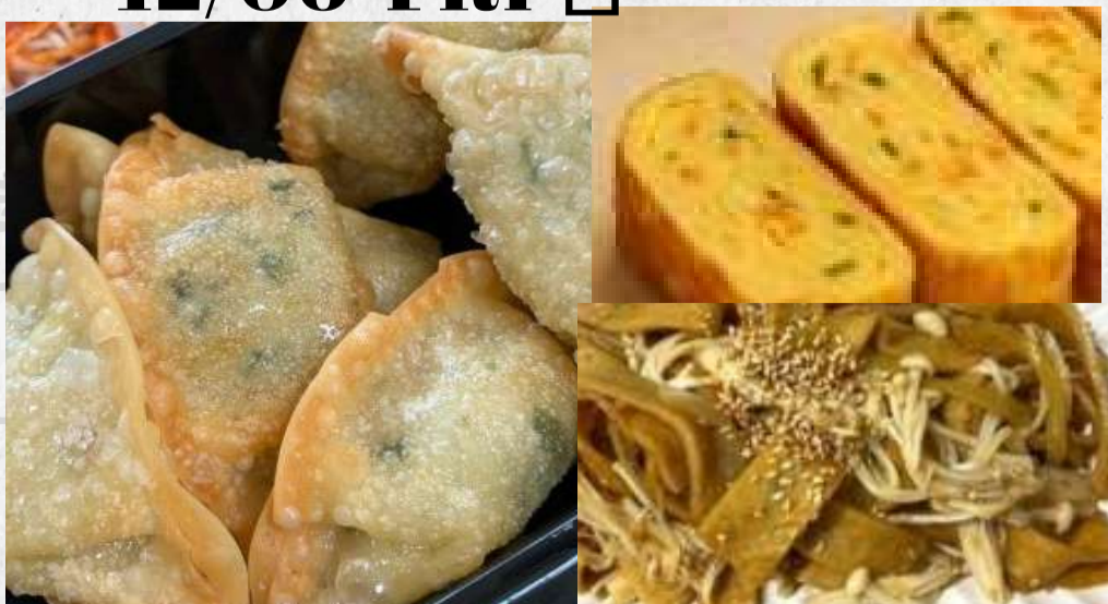
DUMPLINGS, MUSHROOM FISH CAKE & EGGROLLS