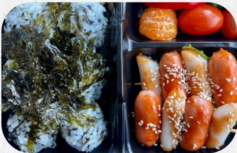
SOTTEOK , SEAWEED RICE