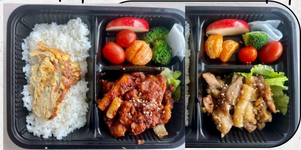
CHICKEN DAKGALBI/ OR BULGOGI 닭갈비/치킨불고기 중 선택